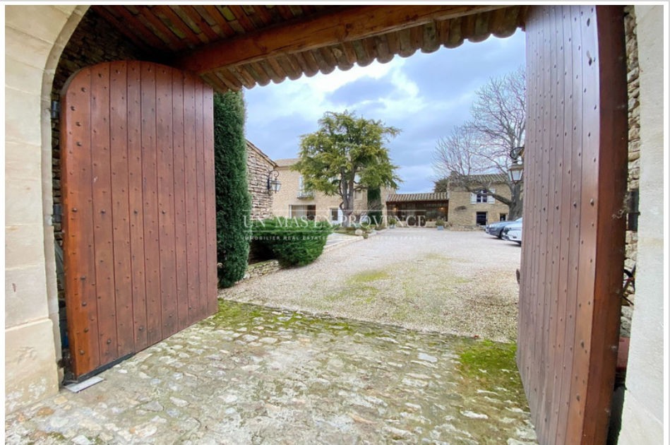
Farmhouse Ref. : V2602M Gordes

Document non contractuel 27/07/2024 - Prix T.T.C